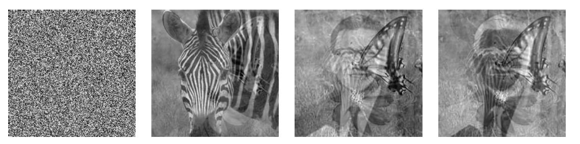
Figure 2. Result of separation by ICA(not separated)