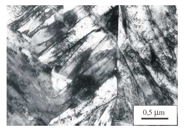
Figure 2. Lath martensite structure; finishing rolling temperature: 900°C