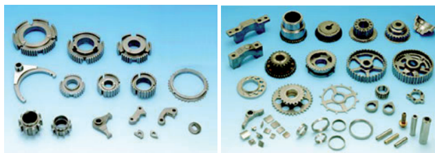
Fig. 2. Powder metallurgy transmission and engine parts

Powder metallurgy has continued to displace competing cast or wrought technologies in automotive applications [1, 3-5]. As far as size and production quantities are concerned, automotive components and among them, especially, transmission and car engine parts (fig. 2), have proved particularly attractive for powder metallurgy part applications [6].