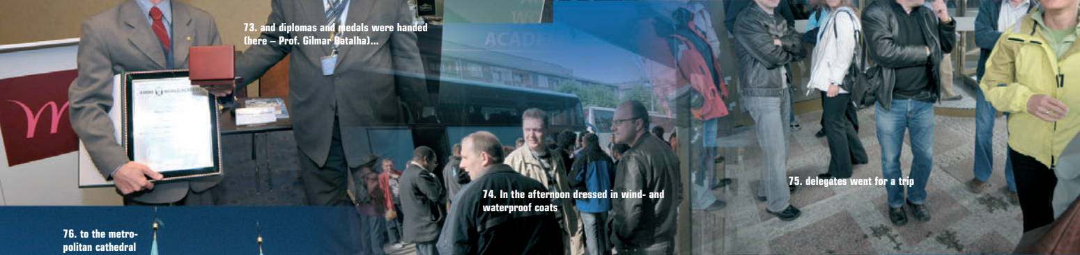
74. In the afternoon dressed in wind- and waterproof coats