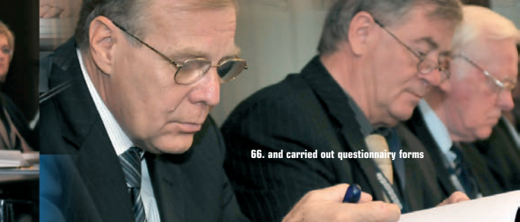
66. and carried out questionnaire forms