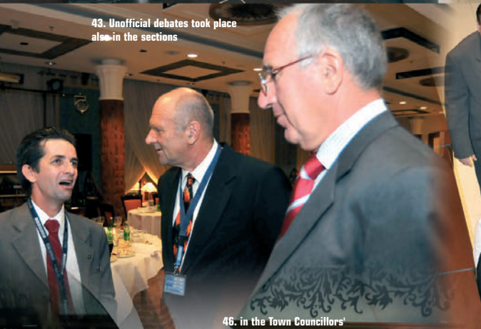
43. Unofficial debates took place also in the sections