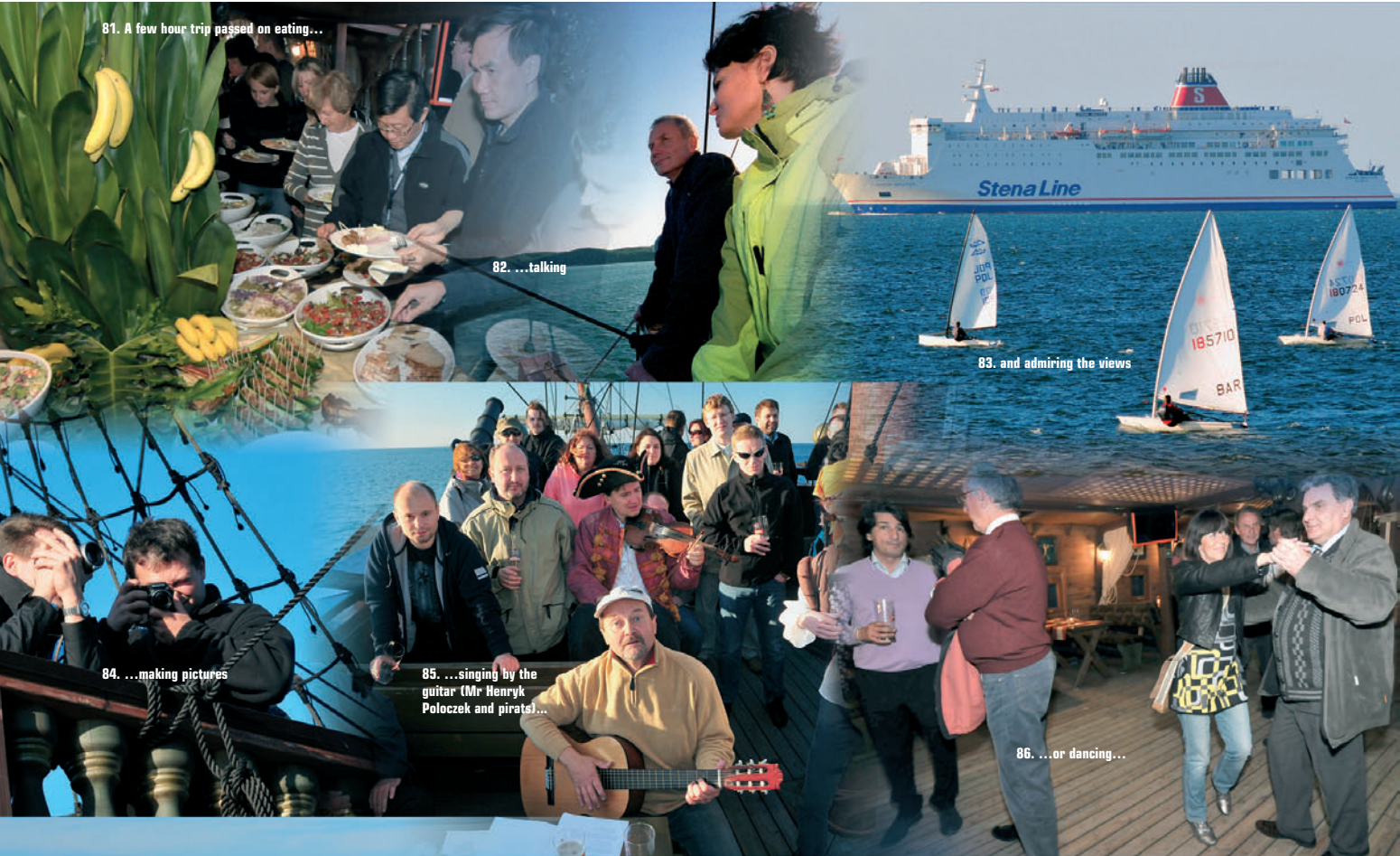
81. A few hour trip passed on eating...