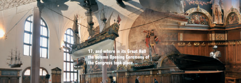
17. and where in its Great Hall the solemn Opening Ceremony of the Congress took place...