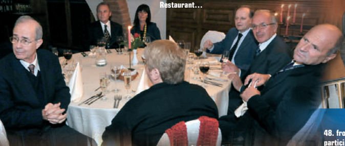
46. In the Town Councillors' Restaurant...