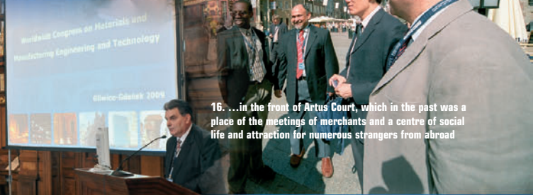
16. ...in the front of Artus Court, which in the past was a place of the meetings of merchants and a centre of social life and attraction for numerous strangers from abroad