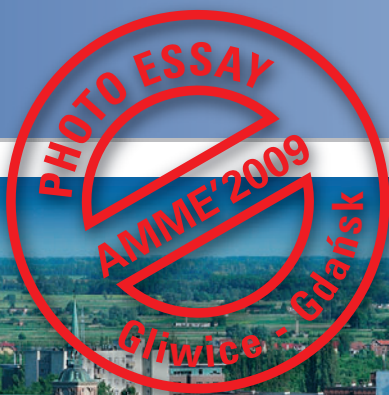
1. Gdańsk - Poland's principal seaport and the largest city in the Pomerania region of Northern Poland lying on the southern edge of Gdańsk Bay (of the Baltic Sea),