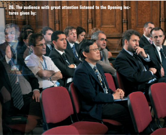
26. The audience with great attention listened to the Opening lectures given by: