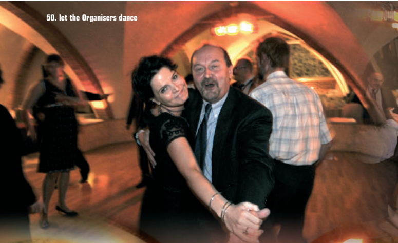
50. let the Organisers dance