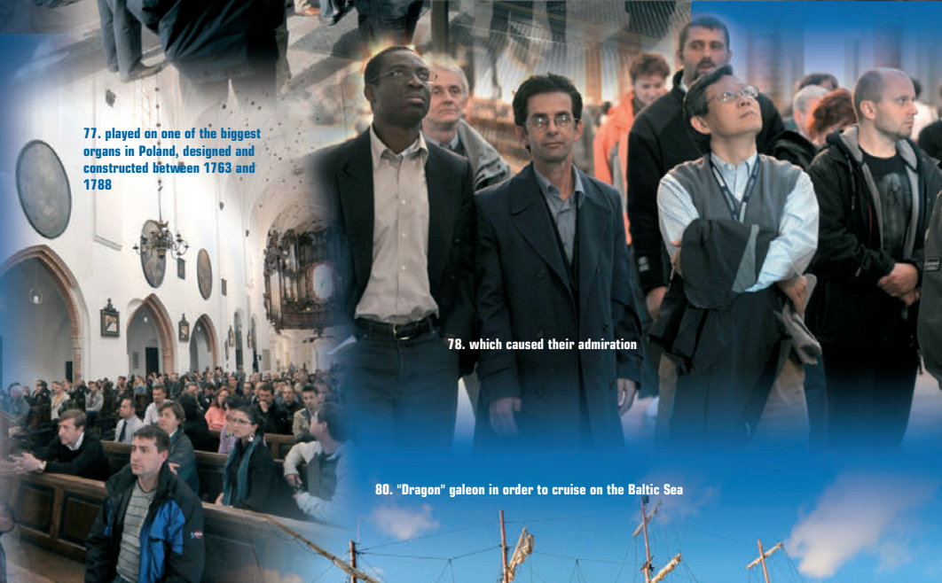
78. which caused their admiration