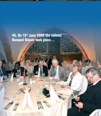
45. On 15 th June 2009 the solemn Banquet Dinner took place...