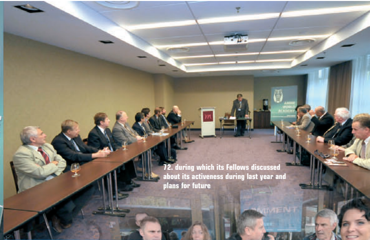
72. during which its Fellows discussed about its activeness during last year and plans for future