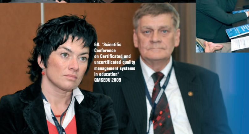
68. "Scientific Conference on Certificated and uncertificated quality management systems in education" QMSEU/2009