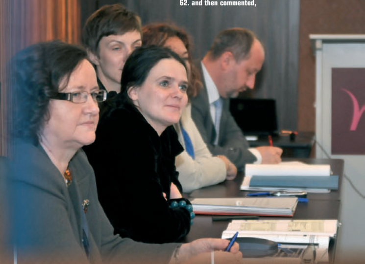
62. and then commented,