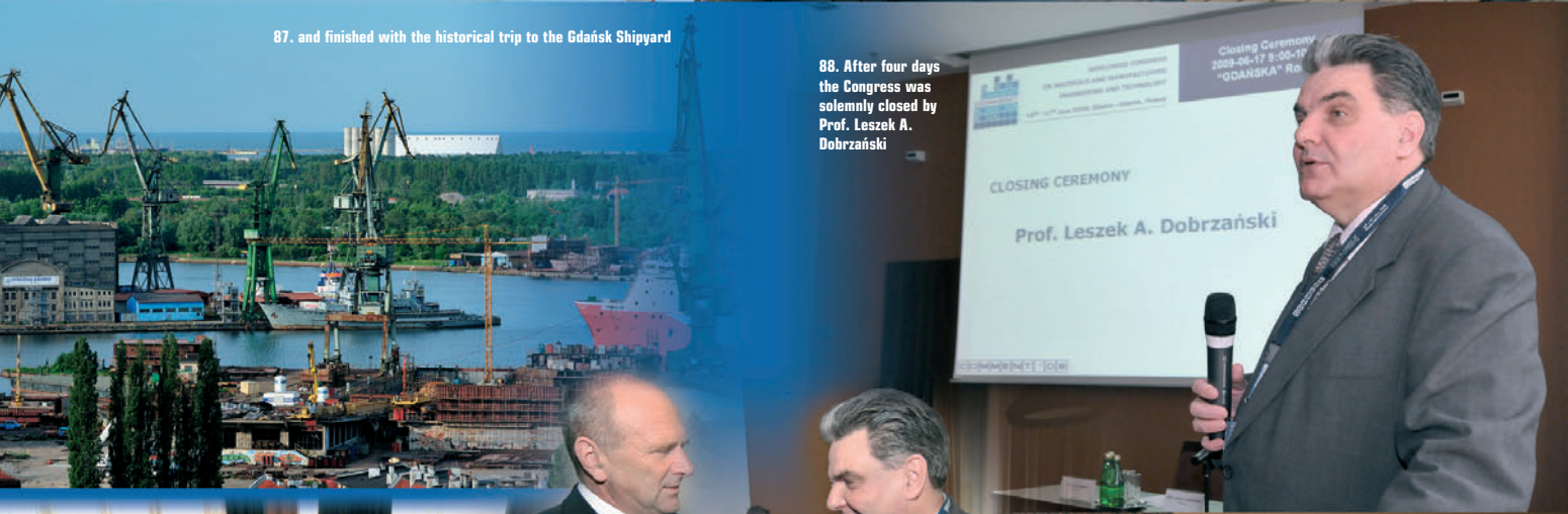
87. and finished with the historical trip to the Gdańsk Shipyard