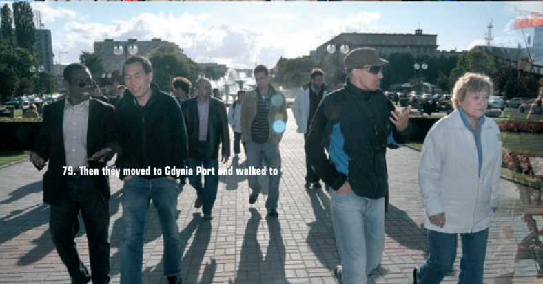
79. Then they moved to Gdynia Port and walked to