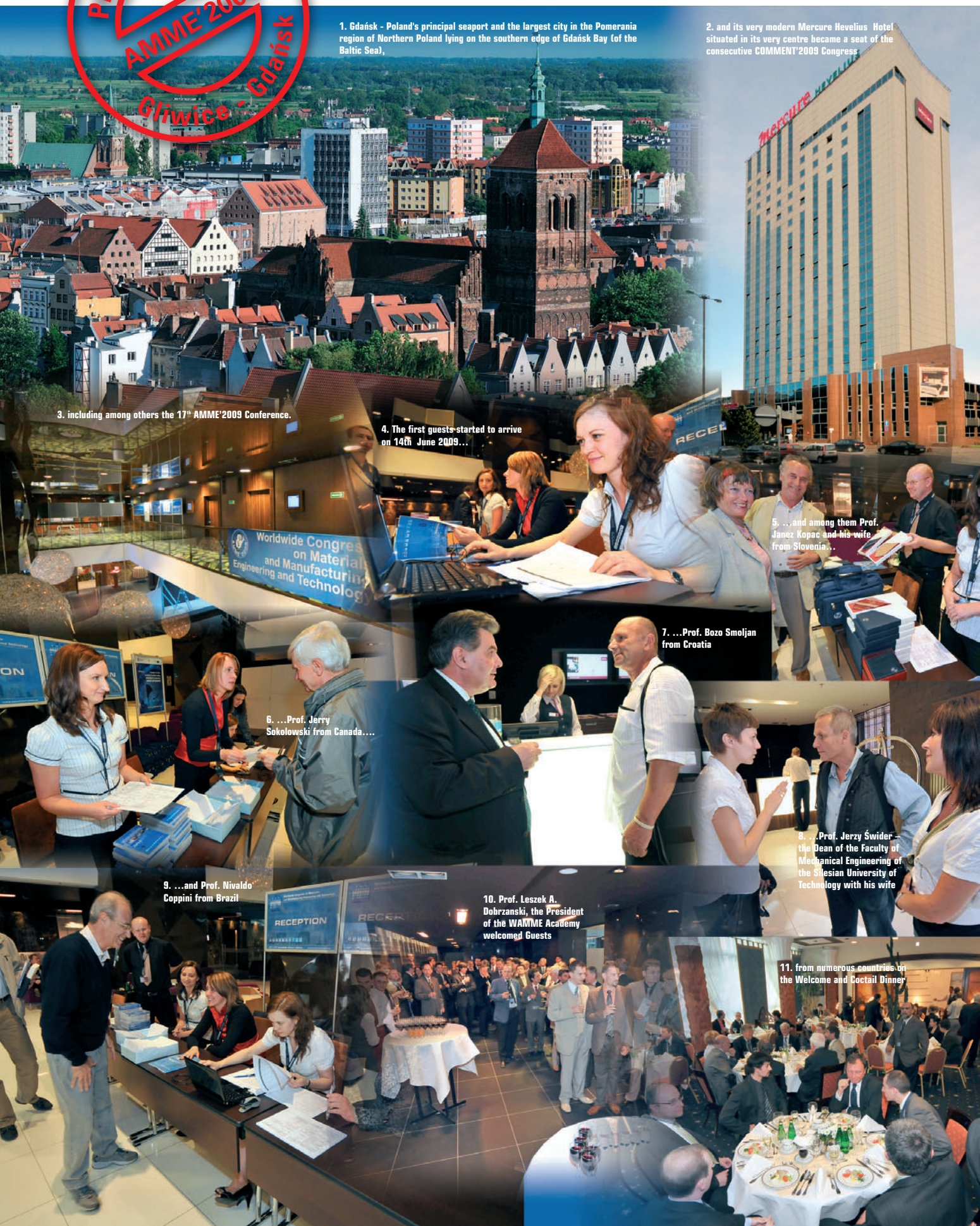
11. from numerous countries on the Welcome and Cocktail Dinner