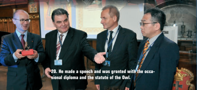
20. He made a speech and was granted with the occasional diploma and the statute of the Owl.