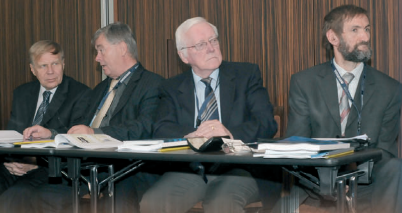
61. who were listed by experts very carefully