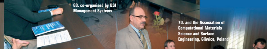
70. and the Association of Computational Materials Science and Surface Engineering, Gliwice, Poland