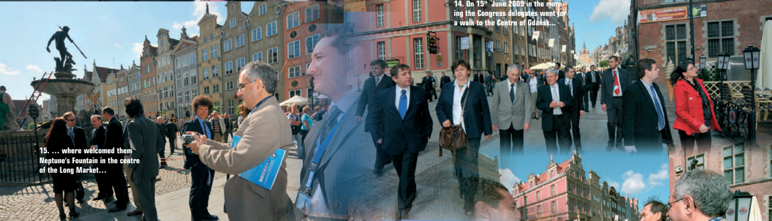
14. On 15 th June 2009 in the morning the Congress delegates went for a walk to the Centre of Gdańsk...