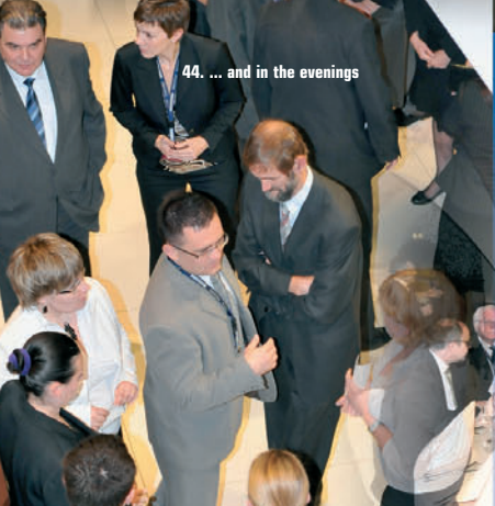
44. ... and in the evenings