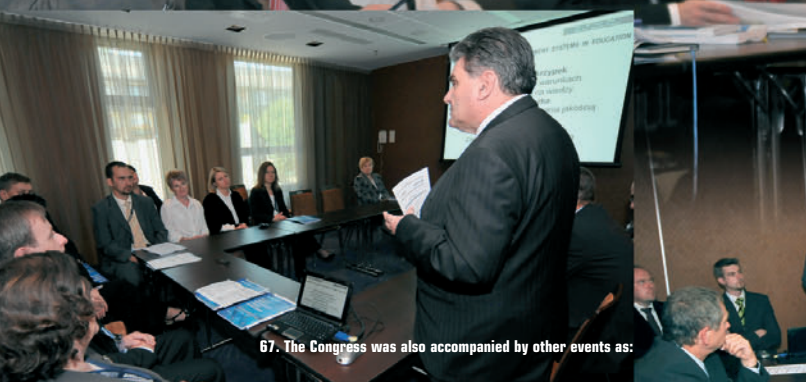
67. The Congress was also accompanied by other events as: