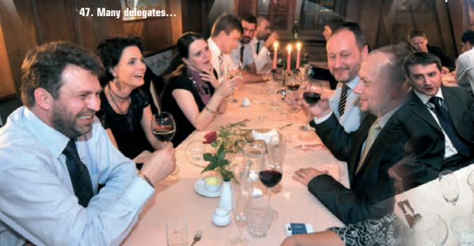
47. Many delegates...