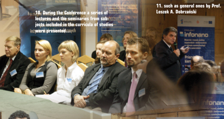
10. During the Conference a series of lectures and the seminars from subjects included in the curricula of studies in Ustron Zawodzie presented