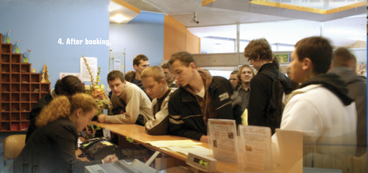
4. After booking