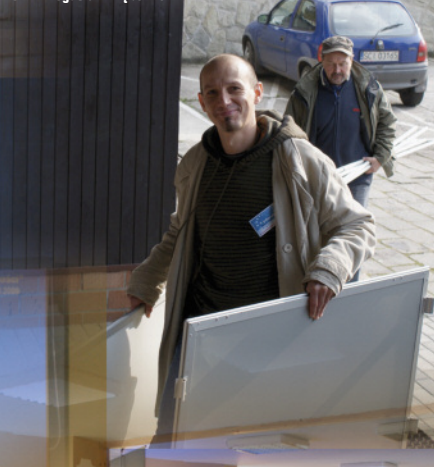
9. in which delegates participated in great numbers, took place.