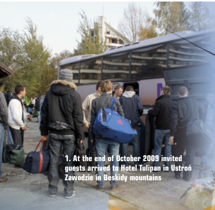
1. At the end of October 2009 invited guests arrived to Hotel Tulipan in Ustron Zawodzie in Beskid mountains