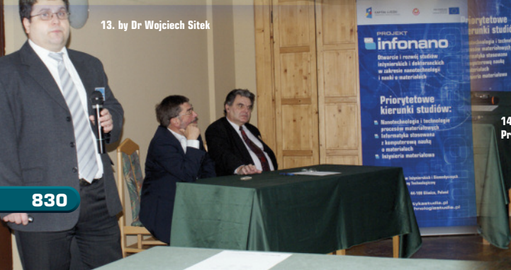
13.