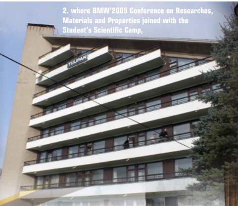
2. where BMW'2009 Conference on Researches, Materials and Properties joined with the Student's Scientific Camp,