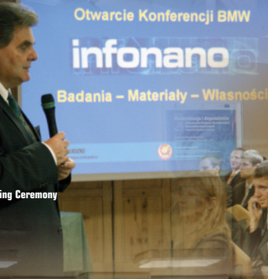
8. the Opening Ceremony