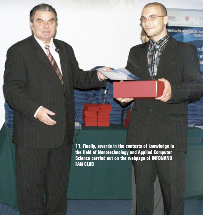
11. Finally, awards in the contests of knowledge in the field of Nanotechnology and Applied Computer Science carried out on the webpage of INFONANO FAN CLUB