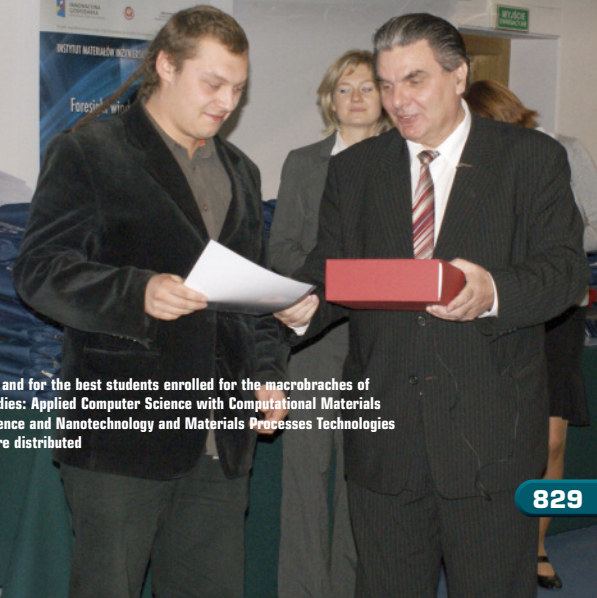
12. and for the best students enrolled for the macrobranches of studies: Applied Computer Science with Computational Materials Science and Nanotechnology and Materials Processes Technologies were distributed