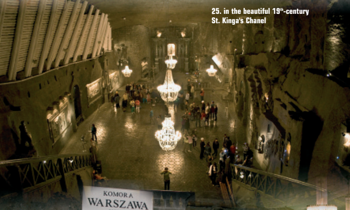
25. in the beautiful 19 th -century St. Kinga's Chapel