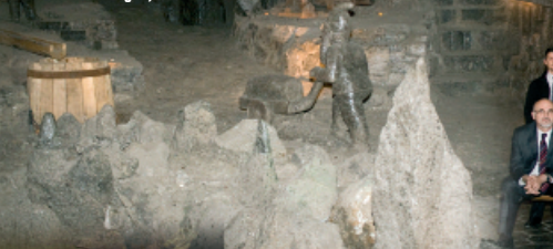
23. developed since the Middle Ages,