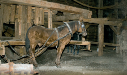
22. and examples of life and work