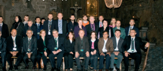
24. and finally making the group photo