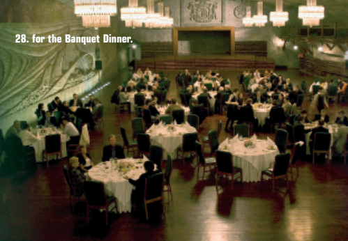
28. for the Banquet Dinner.