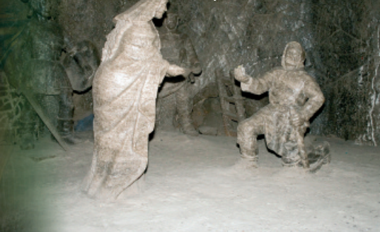
21. and admiring the beautiful salt sculptures